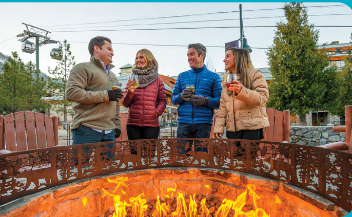
SOUTH TAHOE BEER TRAIL