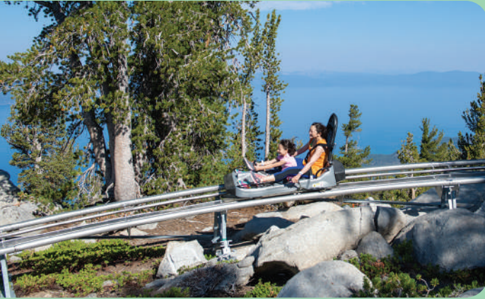
HEAVENLY EPIC ADVENTURES