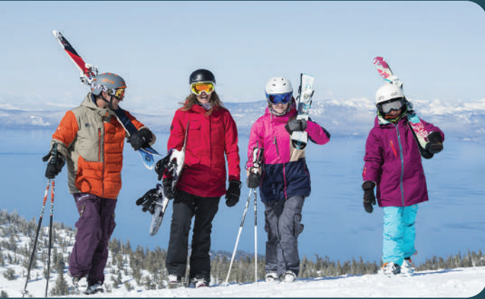
SKI & SNOWBOARD