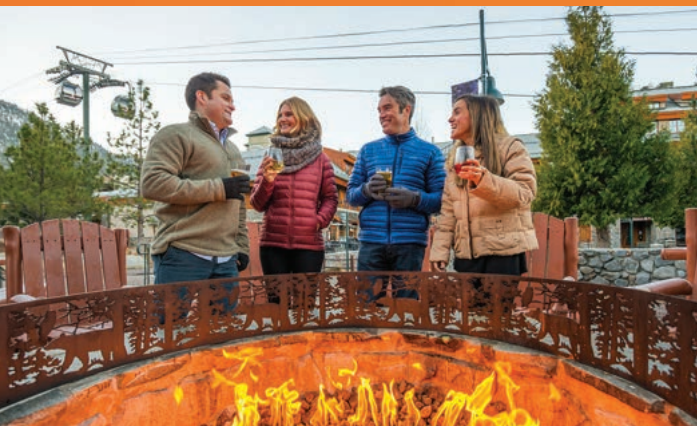
SOUTH TAHOE BEER TRAIL