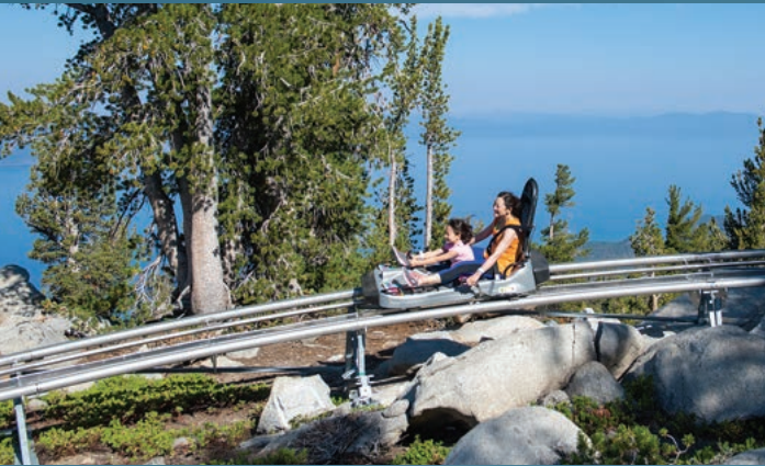
HEAVENLY EPIC ADVENTURES