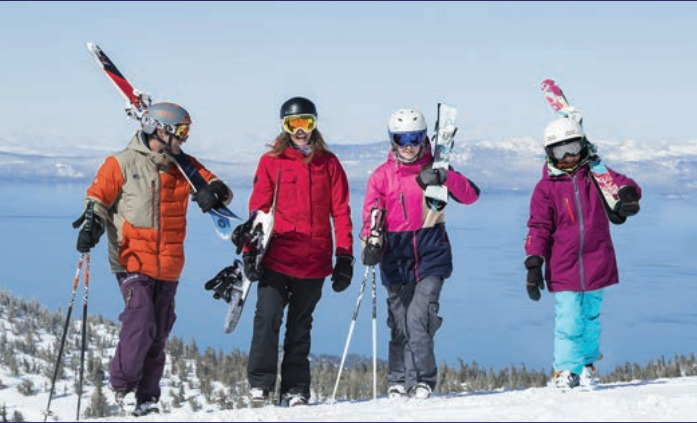
SKI & SNOWBOARD